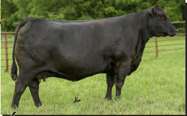
dam Pine View Ruby C001

G A R Early Bird Chair Rock Ambush 1018 G A R Sure Fire# H P C A Sunrise 2172 Hoover Dam# Baldridge Queen S87 Boyd New Day 8005# B/R Ruby 1224