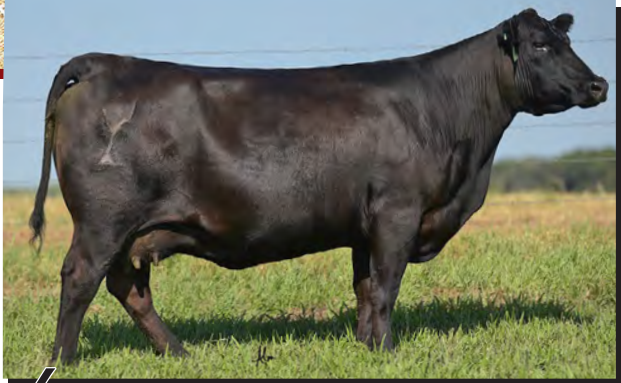
dam Poss Rita 5116