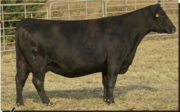
dam Poss Ellunamere 399