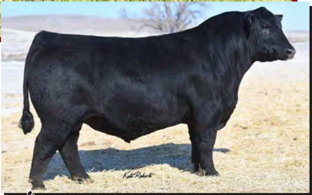
sire Sitz Resilient 10208