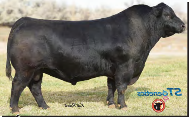
sire Musgrave 316 Exclusive