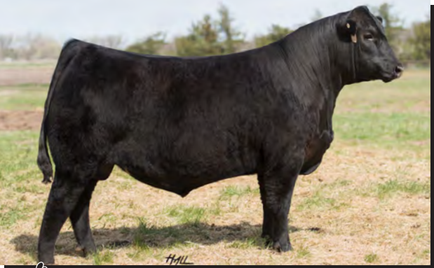
sire WAR Cavalry B063 Z044

Connealy Consensus# Brista of Conanga 927T SydGen C C & 7# War Game Day X029 U239 C A Future Direction 5321# B/R Ruby 9114 E&B 1680 Precision 1023# G A R Ext 916#