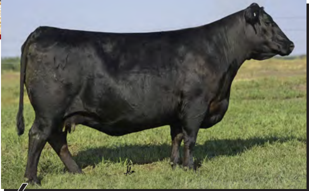
dam Poss Blueblood 6502