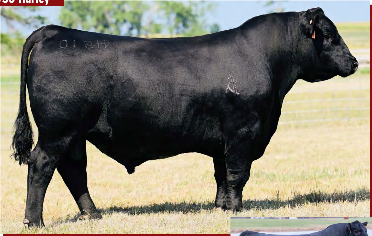
Owned by: Hart Angus, SD, Wall Street Cattle Co., MO