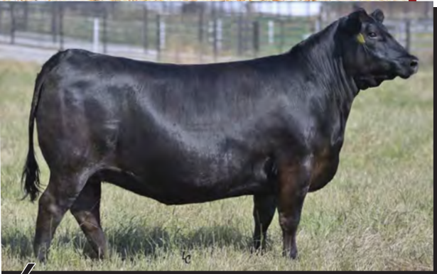
dam Erica of Ellston T220