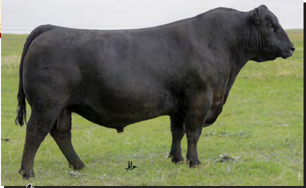
sire Baldrige Pappy