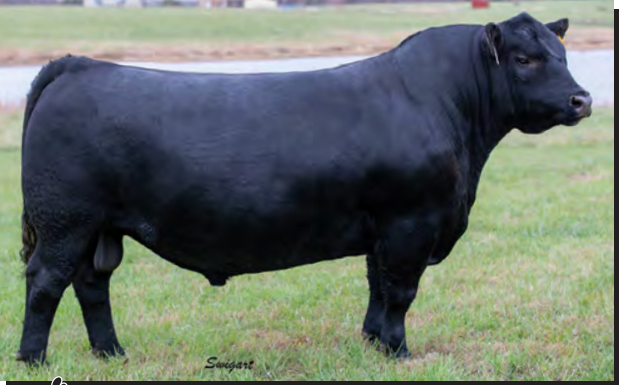
sire Bigk/WSC Iron Horse 025F