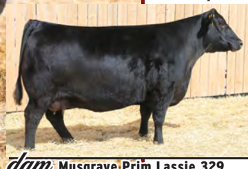
dam Musgrave Prim Lassie 329